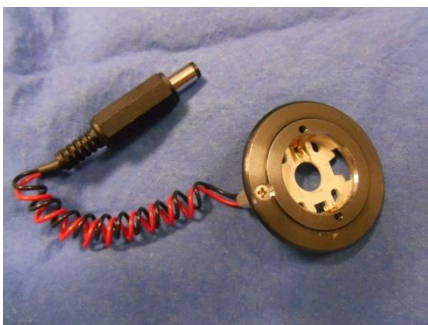
Sample holder insert with battery clamp