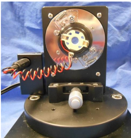
STOE coin cell battery holder

The first data from a full charge-discharge cycle of a LiFePO 4 /Li half-cell, measured in the group of Professor A. Vlad, IMCN/MOST, UCLouvain on a STOE STADI P COMBI equipped with a Mo-tube, a Ge(111) monochromator for pure K \alpha_1 radiation and a Dectris MYTHEN2 1K detector with 1mm chip thickness, is presented in the 3D plot below..